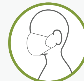
NO-SEW MASK USING A FOLDED SCARF/BANDANA AND RUBBER BANDS/HAIR TIES

For more information on non-medical masks or face coverings consult: https://www.canada.ca/en/public-health/services/diseases/2019-novel-coronavirus-infection/prevention-risks/about-non-medical-masks-face-coverings.html