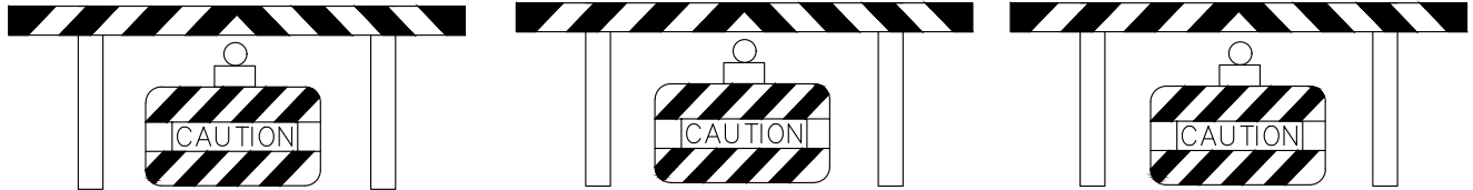
FULL BARRICADE (C-16)