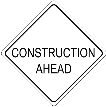
900 mm x 900 mm C-1