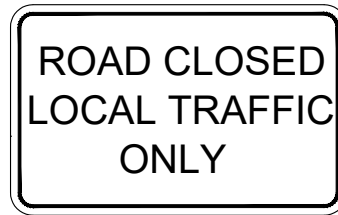
760 mm x 1220 mm C-9