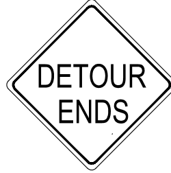
600 mm x 600 mm C-1