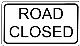
600 mm x 760 mm C-8