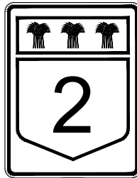
M-2 where required