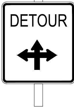
ID-ITR or L (IDENTITY)