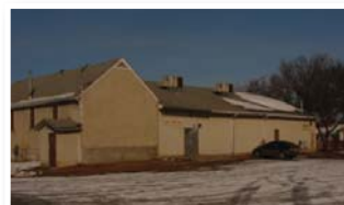
East End Hall