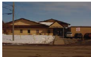
Bernice Sayese Centre